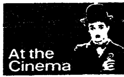
At the Cinema

As the picture proceeds its satire becomes so overblown that it began to long for a little subtlety. But